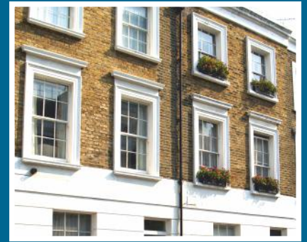
Traditional Residential Installation

This is a new product, which is still in development. E.&O.E.