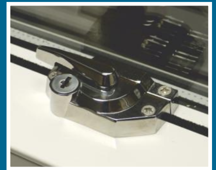
Attractive Key Locking Fitch Catch