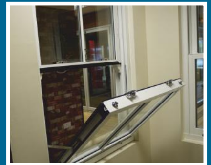
Tilt-In Facility For Easy Cleaning