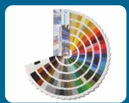
Available In 200+ Colours