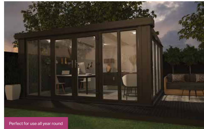
Perfect for use all year round