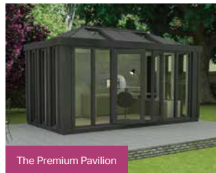
The Premium Pavilion

This grand design adds a luxurious finish to your garden, with its high roof, extensive glazing choices and high thermal performance perfect for a superior garden retreat.