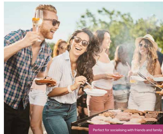
Perfect for socialising with friends and family.

Surrounded by views of your garden, and in the privacy of your own home, your own personal fitness hub at the end of the garden will be better than going to the gym.