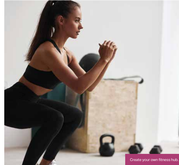
Create your own fitness hub.