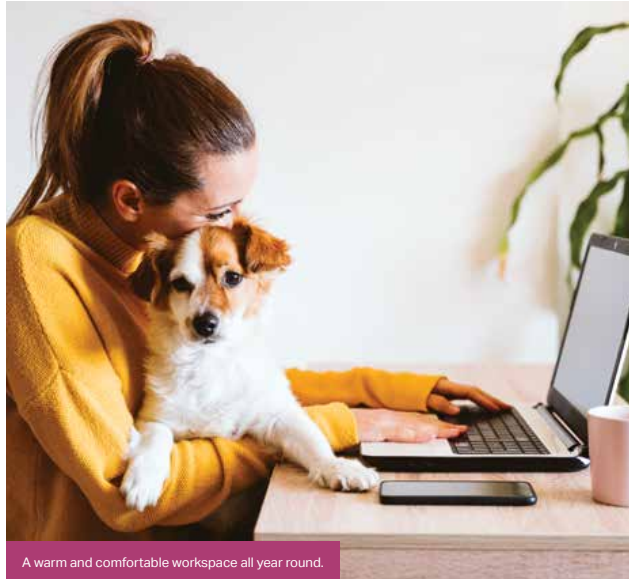
A warm and comfortable workspace all year round.

Providing a warm and comfortable workspace all year round, they are also very efficient to run. Our range of floorplans give you plenty of options for break-out areas and co-working.