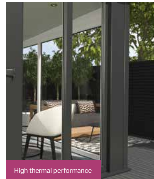
High thermal performance