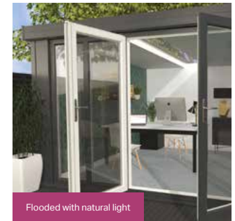
Flooded with natural light