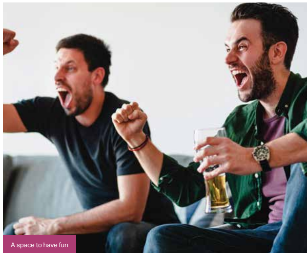
A space to have fun

Appreciate the beauty of the outdoors and have fun in the warmth of an Ultraframe Garden Room.