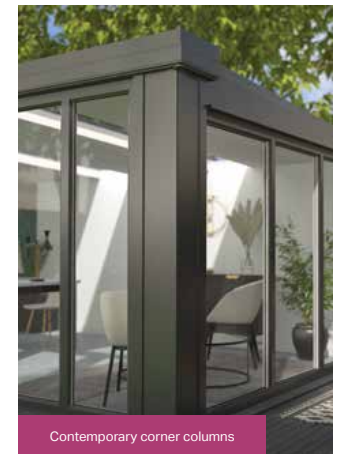
Contemporary corner columns