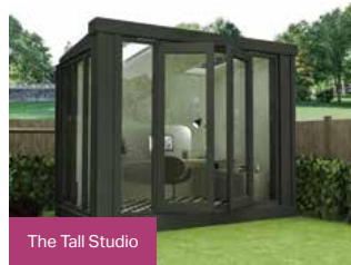
The Tall Studio

Perfect for the corner of a garden, the Studio's design maximises space within planning permission regulations- ideal for a home office or a small outdoor living space.